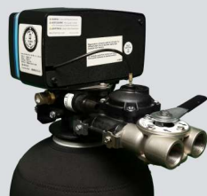
Rear view showing in/out connections