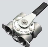
Stainless steel bypass vave