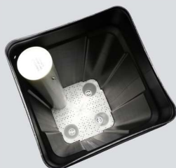
Looking down into salt tank Safety float / Dry salt platform