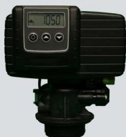
Front view of control valve