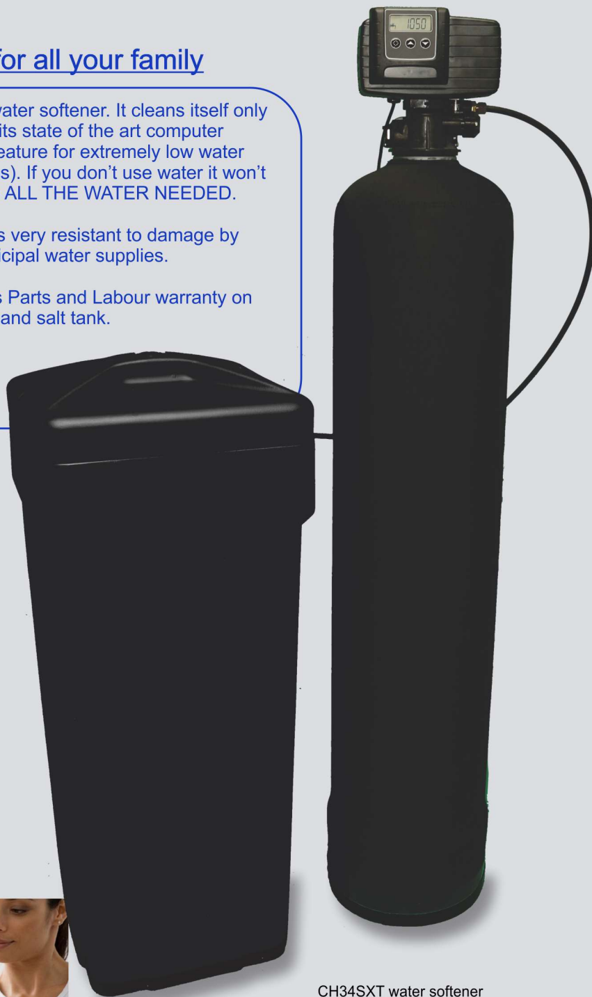
CH34SXT water softener

905-853-7082 1-800-263-1294 WhiteWaterServices.ca