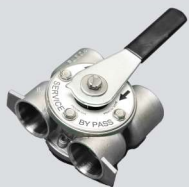
Stainless steel bypass vave