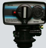
Front view of control valve