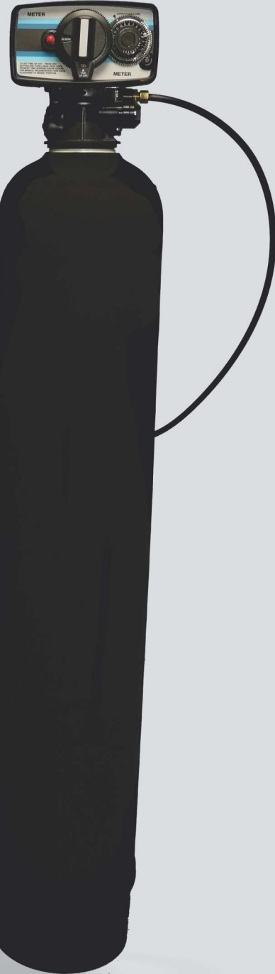
Ch34MI water softener