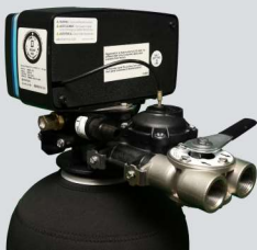
Rear view showing in/out connections

You can expect 20 to 30 years of service from your CH34MI water softener.